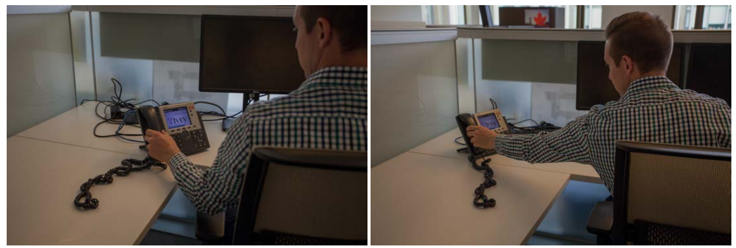
Figure 12 and 13. Phone placement