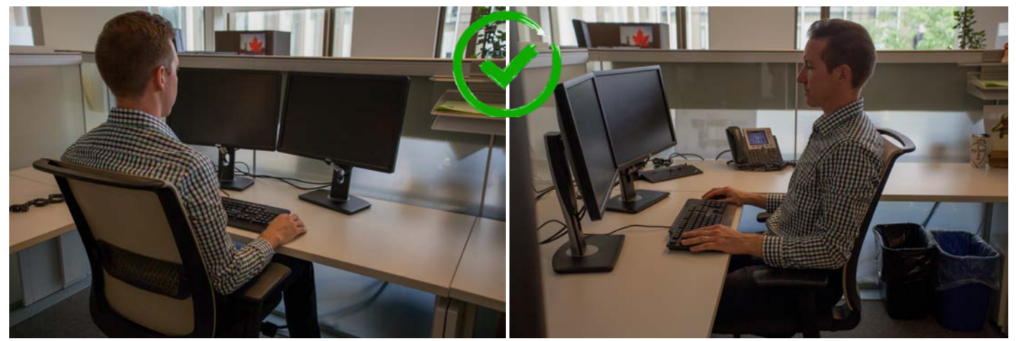
Figure 2 and 3. Optimal desk orientation