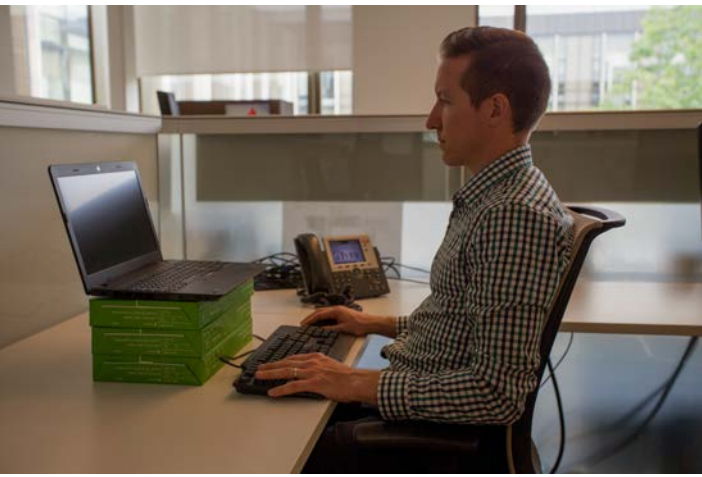
Figure 18. Optimal laptop placement

Generally speaking, laptops promote awkward posture of the neck, back and upper extremities. Neutral posture awareness should be emphasized when using a laptop. Laptop should be kept close to body to avoid excessive reaching. Neck and back should remain in a neutral posture as much as possible.