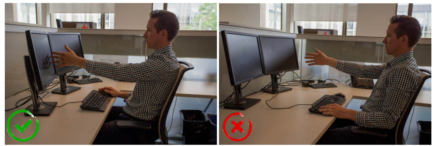
Figure 6 and 7. Monitor distance set-up