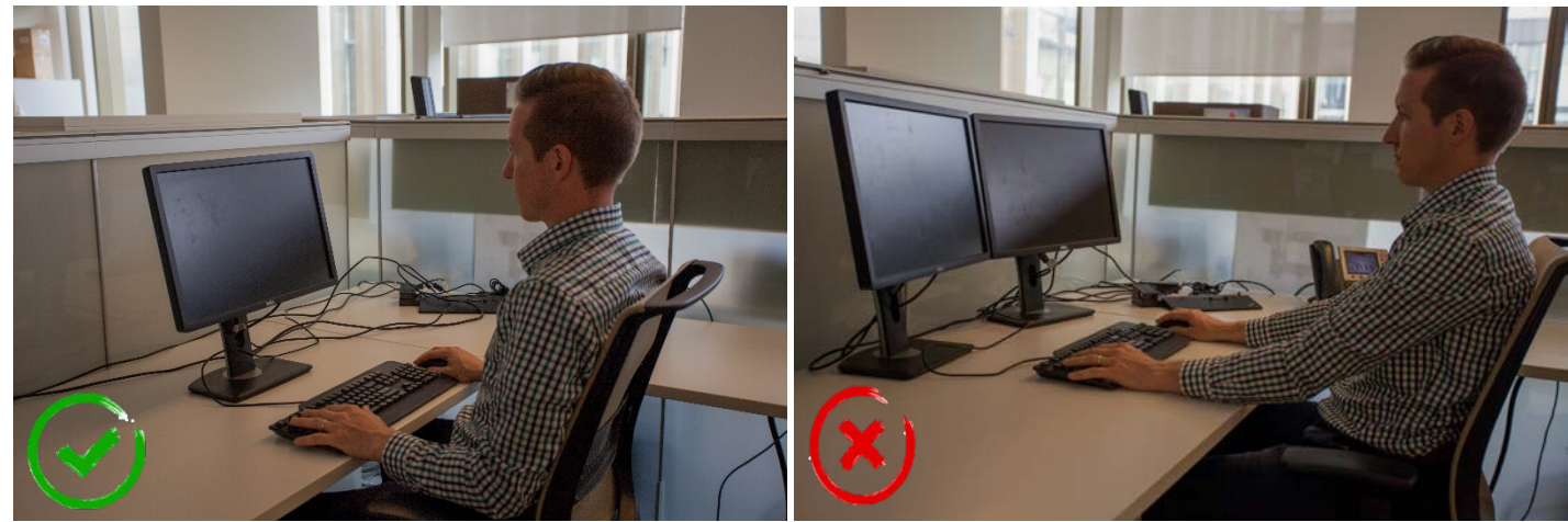
Figure 14 and 15. Keyboard/mouse placement

Optimal placement of the phone will depend on frequency of use. If phone is used very infrequently, it can be located farther from the body (Figure 13). This position does increase the required reach and possible strain so if phone is used more often it should be located close to user to reduce this reach (Figure 12.). Alternatively, considering the use of a headset or speaker phone if appropriate can also help to reduce awkward neck posture (cradling of phone head set).