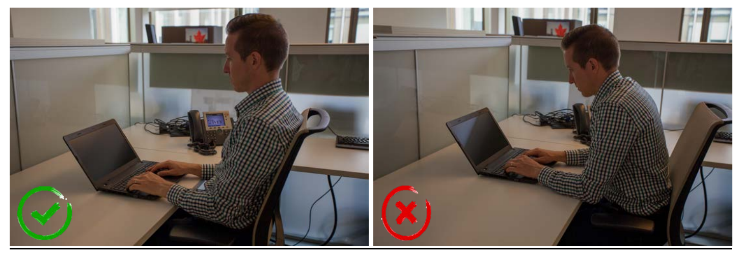
Figure 16 and 17. Laptop use