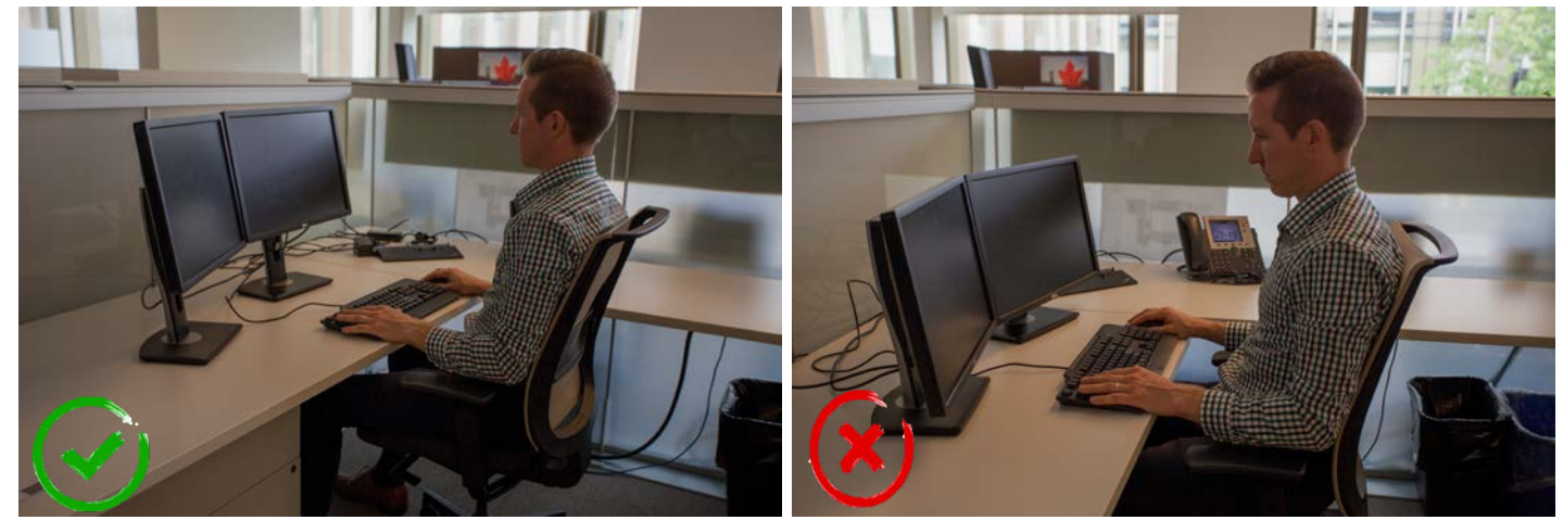
Figure 8 and 9. Monitor height

Monitor set –up is important to consider as this can help keep a person sitting comfortably in the chair. Distance and height should be adjusted to each user. Monitor distance can be adjusted with reference to Figure 6. Monitors should be within approximately one arm's length when sitting optimally in the task chair. Any further will promote eye strain and possible poor seated posture i.e. perching