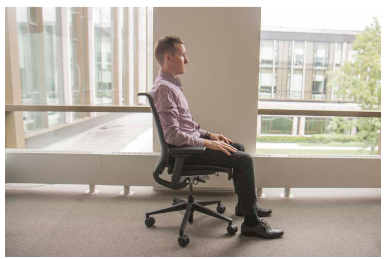
Figure 1. Task chair set-up