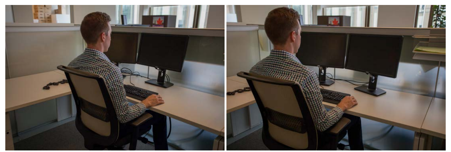
Figure 10 and 11. Single vs. dual screen use