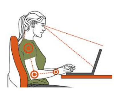
Hunching over a laptop with arms elevated