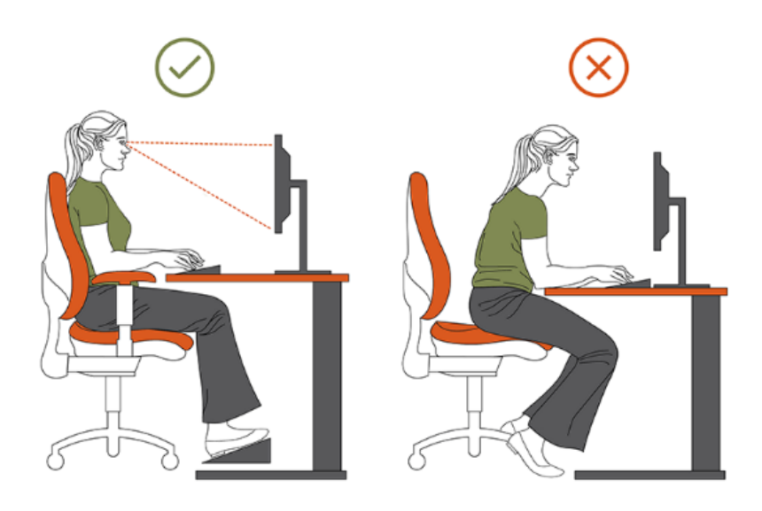
Neutral versus hunched seated posture